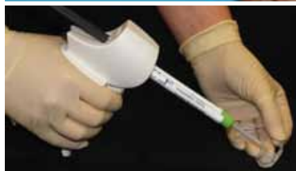
Figure 6 and 6a

Subsequently, the Aqua Splint is inserted in the lower jaw (saddle on 35/36 or 45/46). A reverse "V" marks the middle of the connecting water tube and facilitates accurate positioning between 31, 41. Strong contact between the tube and the gingiva should be avoided. (Fig. 7)